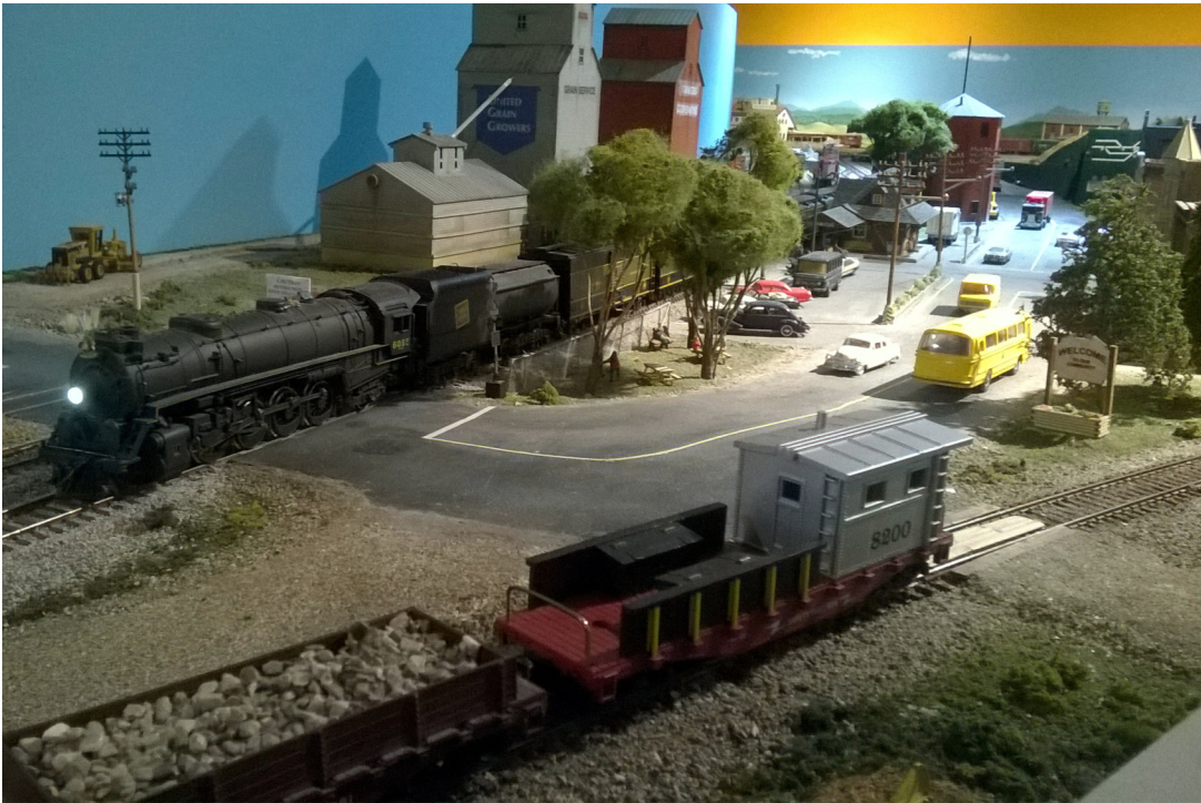
LEFT: A CN passenger train stops at the Coyoti Flats station. This shows the grain elevators, water tower, and the main road through downtown Coyoti Flats.

The era I model is about 100 years long. Because we can run trains of any era on Free-mo I have rolling stock and locos from steam to modern. I would like to add a couple of storage tracks so I could better break the operation into the two eras of steam and modern, and create switch lists appropriate for each era.