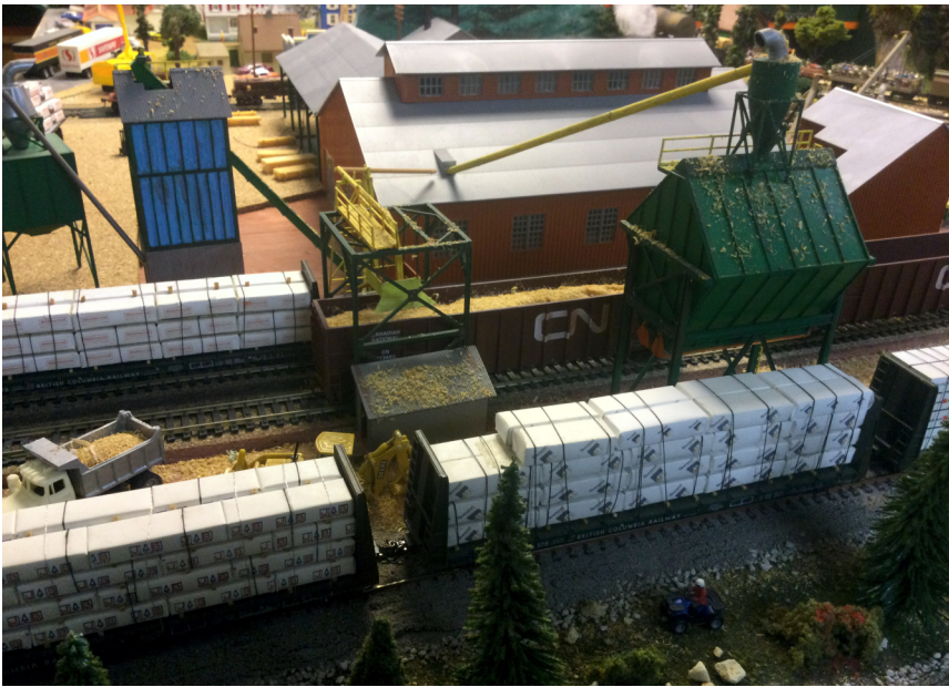
LEFT: Weldwood Lumber Co. sawmill. The lumber loads were hand built.