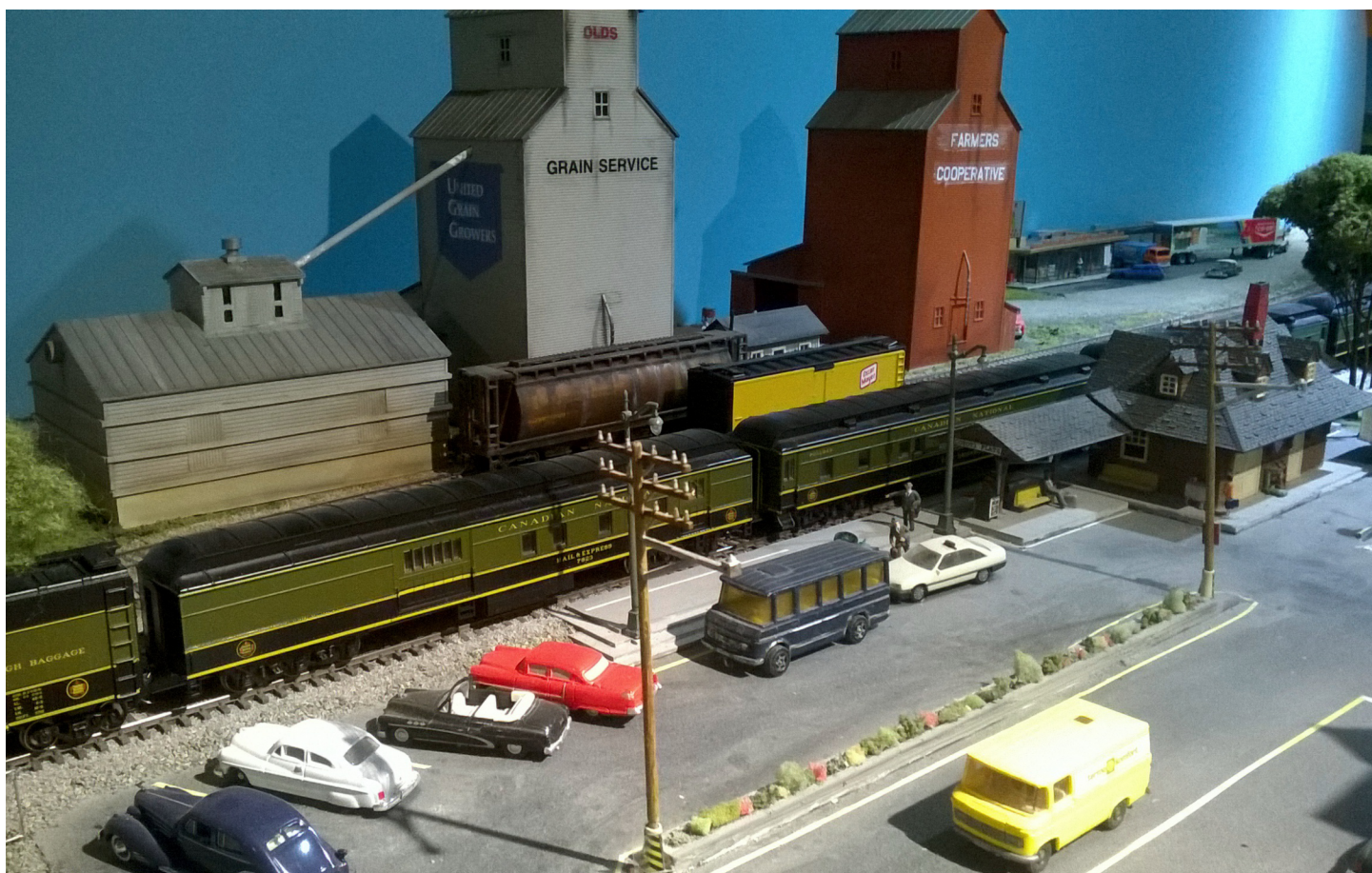
ABOVE: A CN passenger train stops at the Coyoti Flats station next to a couple of classic grain elevators on David Ross's layout in 150 Mile House. Take a closer look at this, and one other Cariboo layout, starting on page 6.