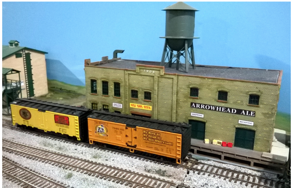
RIGHT: The Arrowhead Ale Brewery at Nobleton. This started as a kit for a 2" deep backdrop building. I enlarged it to full size and added details.