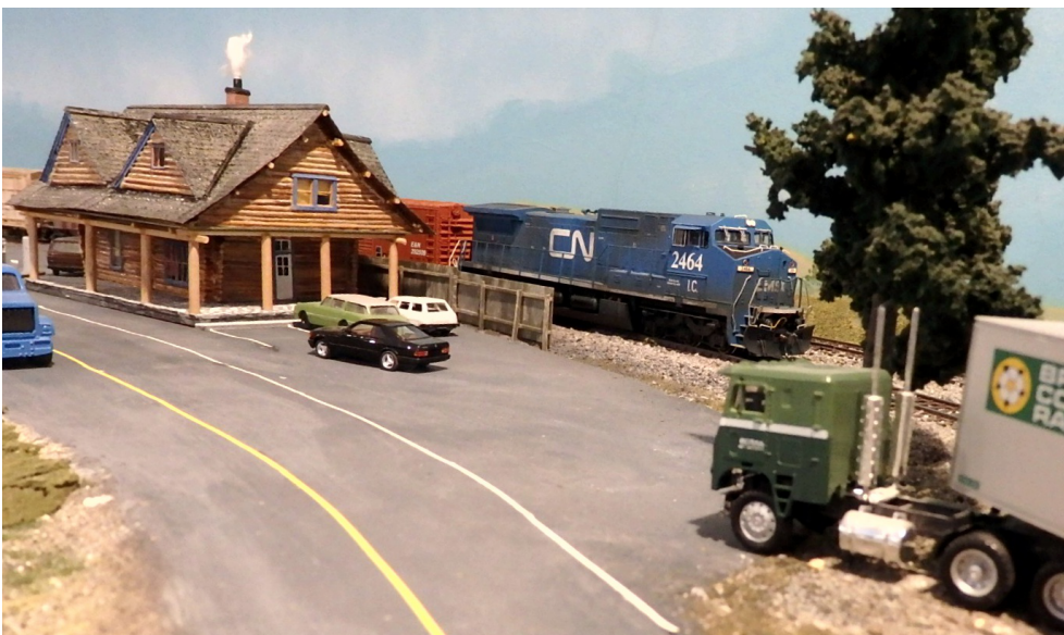
LEFT: Russell's Road House. Another scratch built structure by Keith Watkin of Quesnel. CN freight passing by.