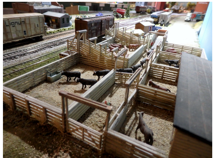
ABOVE: The stockyard at Coyoti Flats,