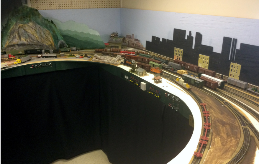
LEFT: Royston yard on the south end of layout with cattle yards in distance.

Our local club, the Quesnel Model Railway Club, used to have between 8 and 16 members and had a large layout built in a downtown shopping mall. Unfortunately, the club is now in limbo as the mall closed and we lost our layout space. We have formed a Society and we have Tom Mower, boots to the ground, trying to find a new home using all aspects of the three levels of government, municipal, provincial and federal, to no avail so far.