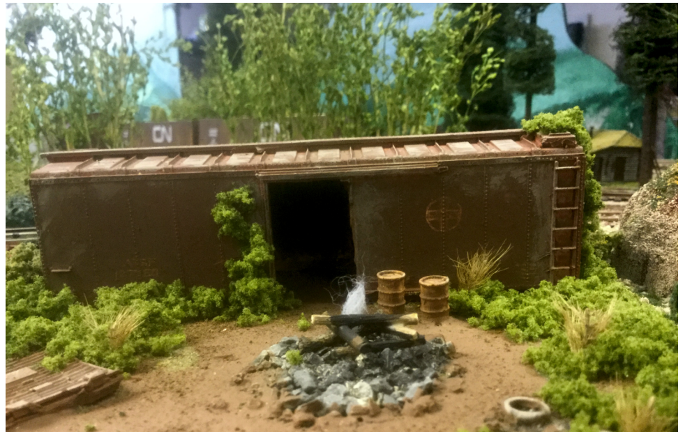
RIGHT: Hobo camp near Hill Lake.