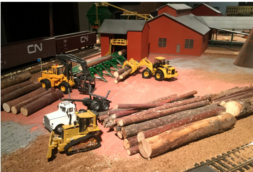
LEFT: Log sort at Weldwood Lumber Co.