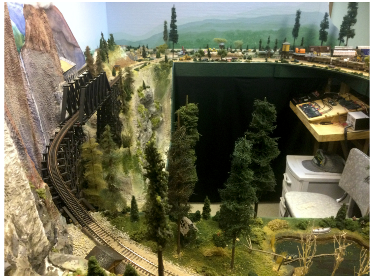
RIGHT: North end, Bear Creek trestle, Whisky Falls, Hill Lake, engineers control.