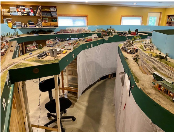
ABOVE: This shows the main part of the layout room, with a bit of Chelig yard to the left, the branch line in the middle, and main line curving around to reach Coyoti Flats just to the right.