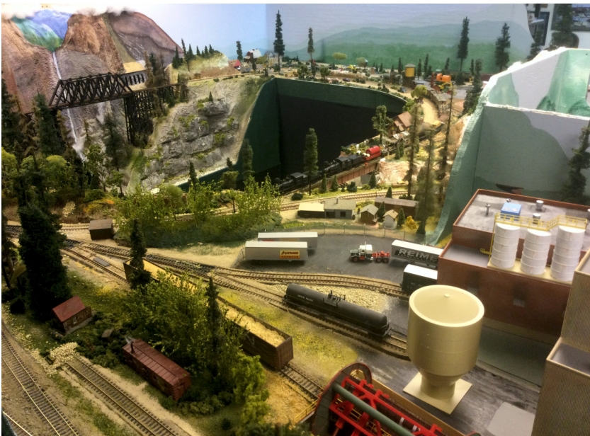
LEFT: Charmin Pulp and Paper in the foreground, steam logging crew train in centre of photo, Whisky Falls at the back.